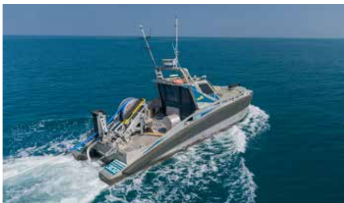
Seagull USV with TRAPS – Towed Reelable Active Passive Sonar