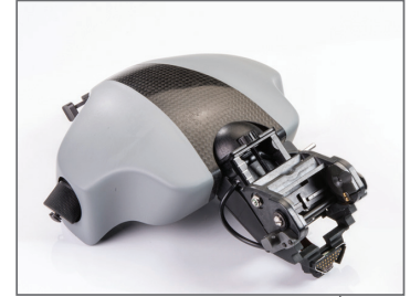
Eyepiece compatible with either adaptor