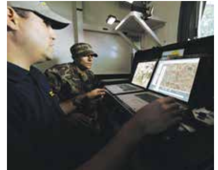
Live Training Instructor Station