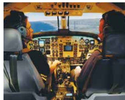
King Air B-200 Facility