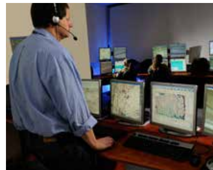
Forward Observer Simulator Facility