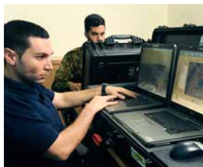
Trainer Portable Station