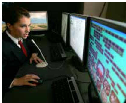
Mi-8/24 Instructor Station