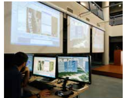
HLS Simulator Facility