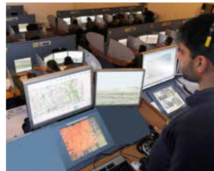
Tactical Simulator Facility