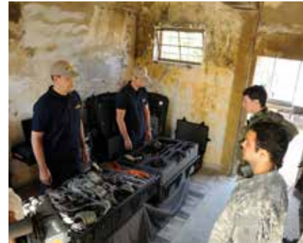
Land Live Training