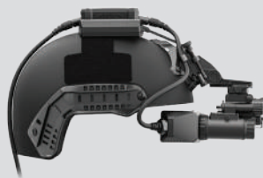
HU with power mount - front configuration