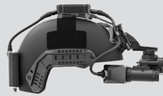
HU with external power source - front configuration