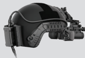
HU with power mount - back configuration