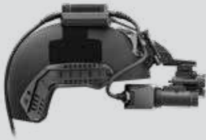
HU with power mount - front configuration