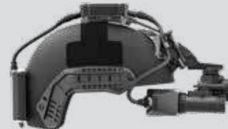
HU with external power source - front configuration