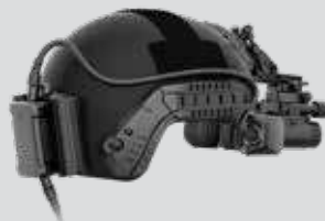
HU with power mount - back configuration