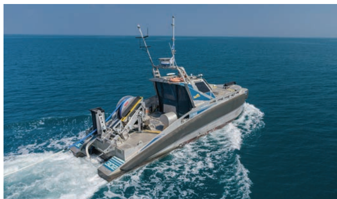
Seagull USV with TRAPS – Towed Reelable Active Passive Sonar