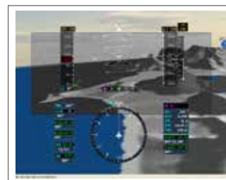
Enhanced Awareness Apps.