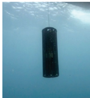
Long Range Dipping Sonar